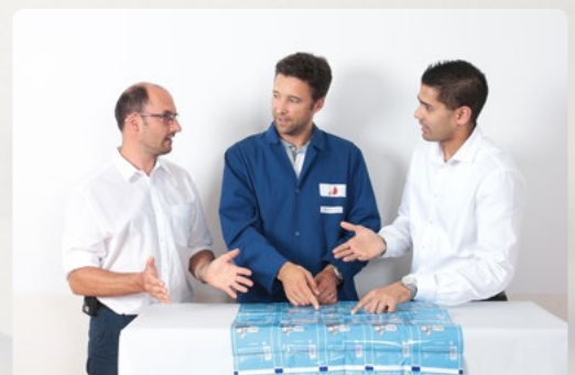
Consultation even during the layout phase

To learn more about our prepress services, please contact Mr. Kronschnabl ( siegfried.kronschnabl@huhtamaki.com ). Alternatively, please visit our website at www.hro-prepress.de