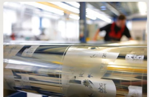
Less cost, time and stress